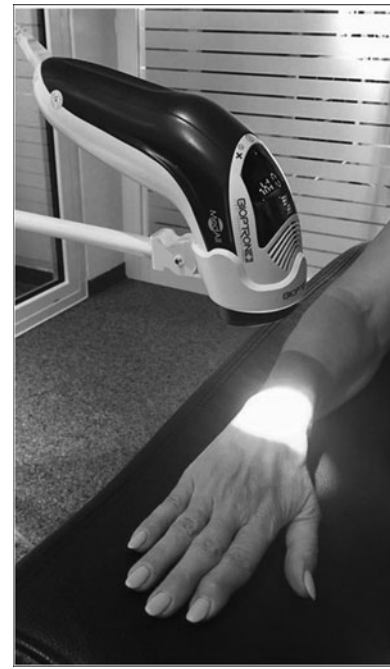
FIG. 1. Patient set-up before Biopton light therapy (simulated patient).

Model: Biopton MedAll, Biopton AG, Wollerau, Switzerland.